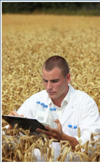
Strategic Research & Development