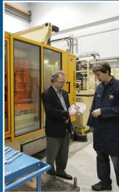
Industrial Research Assistance Program